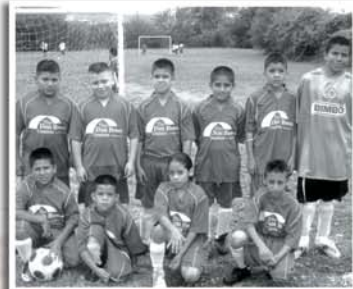
In partnership with other agencies and organizations in the Northeast, the Youth Development Center is teaching teamwork and healthy habits through a new youth soccer league.

Charter High School - Don Bosco provided educational opportunities to students who haven't thrived in traditional public school settings. In 2008-2009, the school had an average enrollment of 184, 81 of whom received their high school diploma.